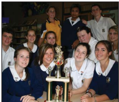
Winners of the 2007 Arcadians Award for School Drama Presentation